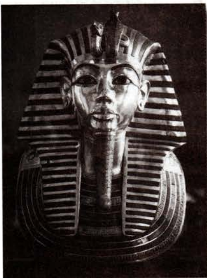
Artifact from King Tut's Tomb

The third period of the Egyptian Civilization is called the New Kingdom , and it lasted from 1600 B.C. until 1100 B.C. This is considered the last great period in Egyptian history. You probably noticed that the Middle Kingdom ended about 1800 B.C. and the New Kingdom began about 1600 B.C. What happened to those 200 years in between? Did Egypt cease to exist? In a way it did. During this time, Egypt was conquered by the Hyksos, who had superior weapons. Eventually, the Egyptians began using these newer weapons as well and were able to win their country back from the Hyksos. Egypt was united once more, and the New Kingdom, sometimes called the Golden Age of Egypt or the Age of Empire, began. Egyptian armies conquered Syria, Palestine, and the area west of the Euphrates River, and Egypt became wealthy.