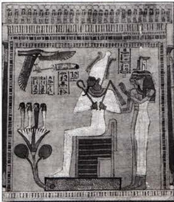
The Book of the Dead

Menes made Memphis the capital of Egypt. To help run the large country, Menes assigned people he trusted to govern different sections of Egypt. These governors, or nomarchs , worked to be sure that all of the commands of the pharaoh were obeyed.