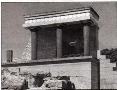
Part of the Palace of Knossos Reconstructed