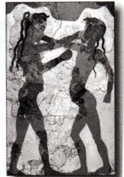
Minoan children boxing

The second benefit of wealth was that the Minoans had leisure time to devote to activities not directly related to survival. Free from the worries of finding food and shelter, many Minoans became interested in other activities and sports, such as boxing and bull-jumping. Bull-jumping involved a jumper taking a charging bull by the horns and either jumping onto the bull's back or leaping over the bull, turning a somersault in the air, and then landing on his or her feet behind or beside the bull. Both young men and young women participated in this sport.