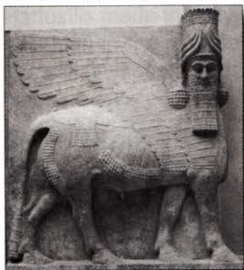
An Assyrian Lamassu

Assyrians developed a thriving trade in Anatolia (Asia Minor). Eventually, the Hittites drove the Assyrians out of Anatolia. During the time of the Babylonian Kingdom, Assyrian power in Mesopotamia grew weaker. By 1550 B.C., Assyria was part of the Mitanni Kingdom. The notable achievement of the Mitanni Kingdom was that it introduced trained horses and chariots into this part of the world.