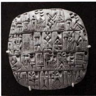
Cuneiform Written on a Clay Tablet