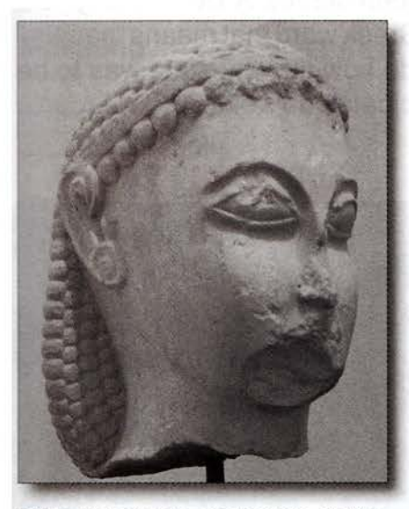
The Dark Ages

After the fall of Mycenaea, Greece entered the Middle Period , which is sometimes called the Dark Ages . It lasted from about 1100 B.c. until about 800 B.c. During the Middle Period, the culture declined. Little is known about this period in Greek history since there are no written records.