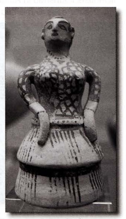
This figure made in Sparta in approximately 1400 B.C. shows a woman in a typical costume from Crete.

Athens and Sparta were just developing during the Middle Period, and they could not have been more different. One difference between the two was the manner in which they governed themselves. In order to understand how different Athens and Sparta were, it is important to understand how government developed in the Greek city-states. Several different types of government were tried over the years by the Greeks. At one time they had leaders similar to a king, but the people thought they could govern better than one person. So they established an aristocracy. An aristocracy is a government by a ruling class. The ruling class in this case was the landowners. This type of government was eventually replaced by an oligarchy. An oligarchy is run by only