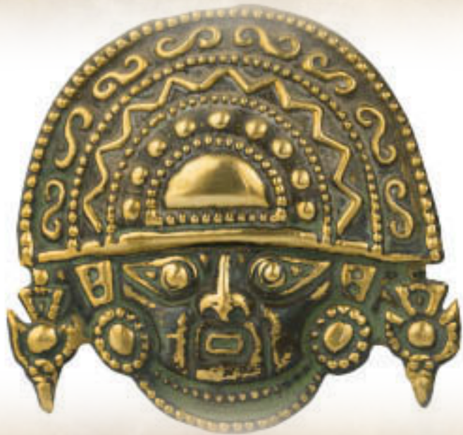
Gold object from the Inca people

Native American nations did not use gold for money. But some of them, such as the Incas and the Aztecs , had many gold objects. Some people in the Americas adorned their bodies with gold jewelry. The Spanish conquerors wanted those riches.