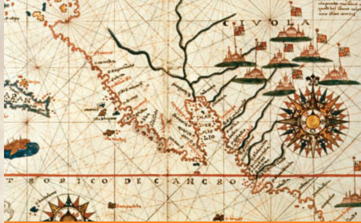
This old map of western North America shows where the Spanish thought the Seven Cities of Cíbola were.

Aztecs: Native American people who lived in southern Mexico