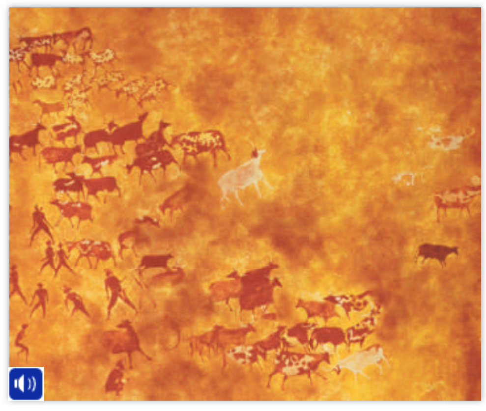
The story of the past is told through words and objects.