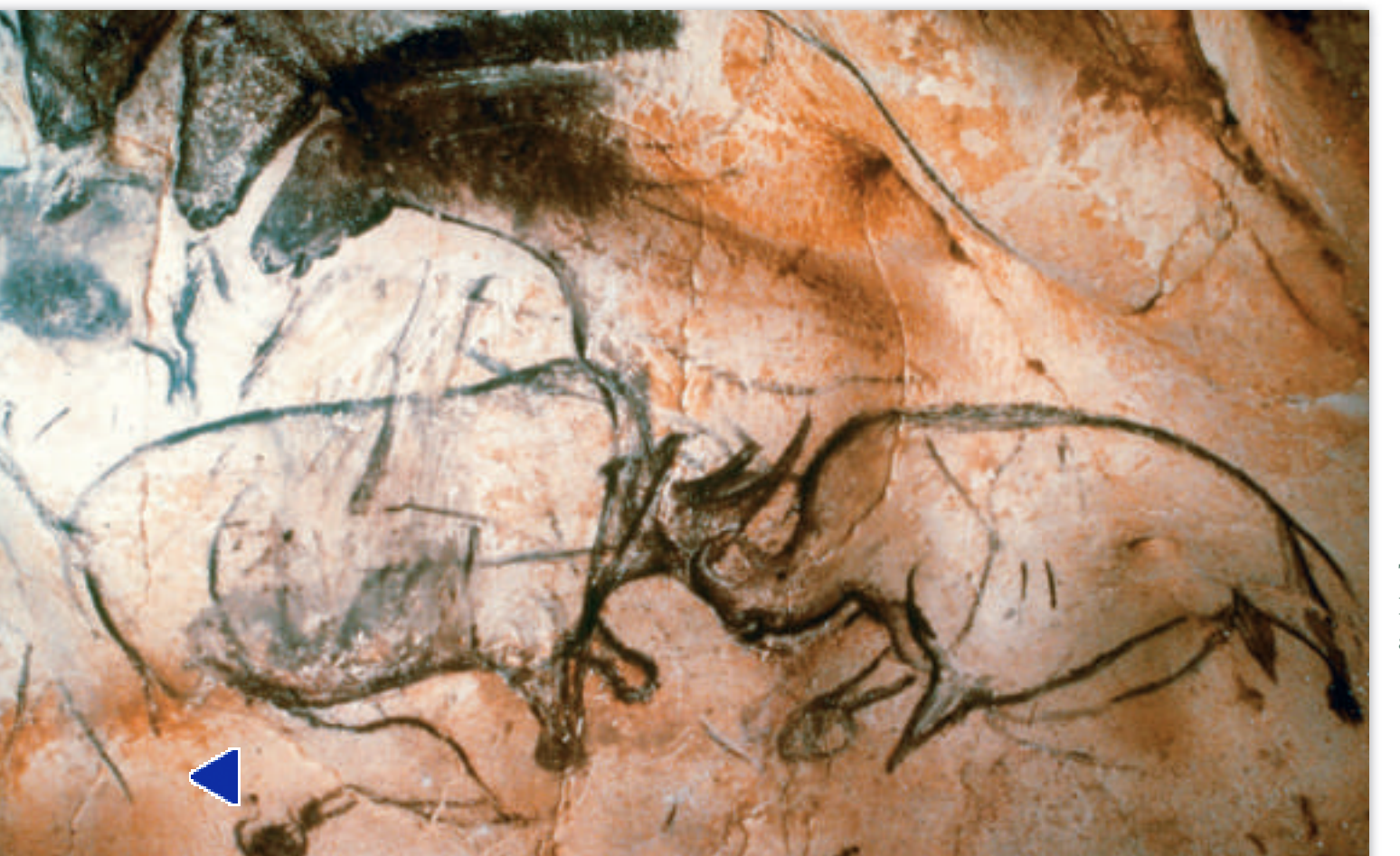
This cave painting in Chauvet, France, shows images of horses and rhinoceros.

Some scholars share the idea that the cave paintings are records to help people remember important ideas and events. When looked at from this point of view, cave paintings are like written records.